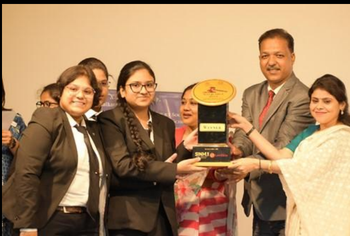
Winners of ‘Xavjudice 2023’