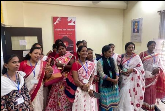
Women from nearby village gathered for the Legal Awareness Session