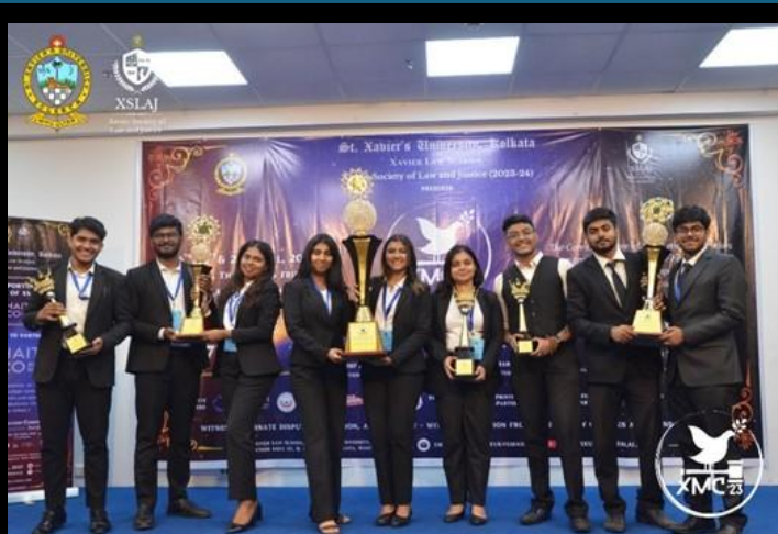
Winners of Xavier Mediation Competition, 2023