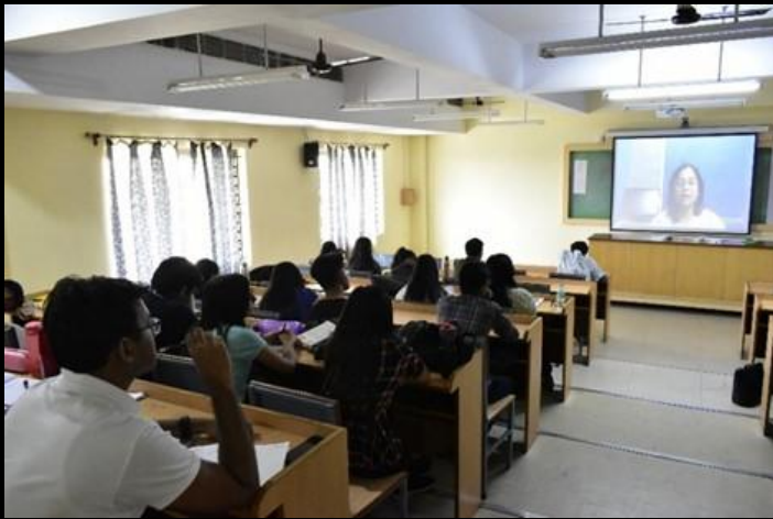
Students of Xavier Law School attending the Lecture on "Economic Analysis of Law"