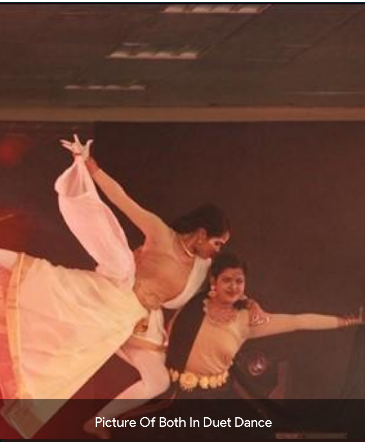
Picture Of Both In Duet Dance