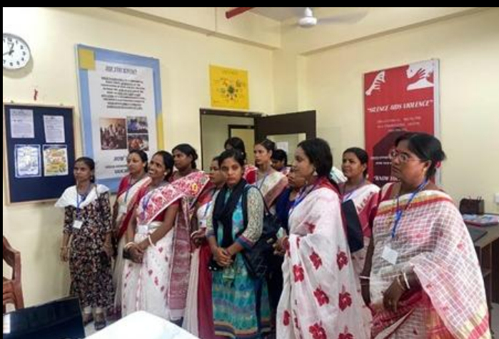
Legal Awareness Session at Dr. B.R. Ambedkar Legal Aid Clinic

St. Xavier's University, Kolkata inaugurated the Legal Aid Clinic on 25th August, 2022 and has been named as Dr. B.R. Ambedkar Legal Aid Clinic as an honor to the father of the Indian Constitution. Gradually, women are becoming the pillars of the society and it is important that they are aware of their rights. Keeping this in view, Dr. B.R. Ambedkar Legal Aid Clinic, Xavier Law School, St. Xavier's University, Kolkata, under the banner of "Know Your Rights", an initiative of the clinic, organized a legal awareness session for women from nearby villages, Kanthalberia, Kulberia, and Jirangacha. The event was conducted to educate and make the women aware of the Legal Aid Clinic and how to access its services. The Legal Aid Clinic and its members were elated to organise such an event and to be able to promote legal awareness to a greater extent for the underprivileged communities in the region.