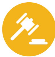
Xavier Society of Law and Justice (XSLaJ)