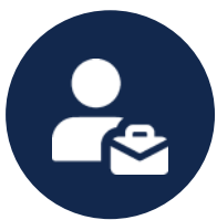
Xavier Commerce and Management Society (XCMS)