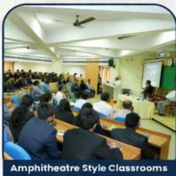
Amphitheatre Style Classrooms