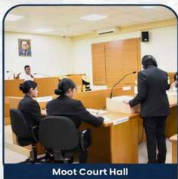
Moot Court Hall