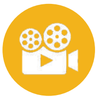
Xavier's Film Society (XINEPHILE)