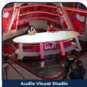
Audio Visual Studio