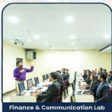
Finance & Communication Lab