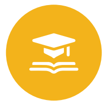
St. Xavier's University Literary Society (XULS)