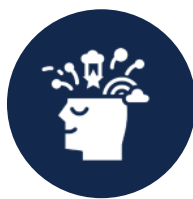
Xavier's University Cultural and Arts Society (XUCAS)