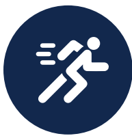
Xavier's University Sports Society (XUSS)