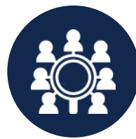
Moot Court Society