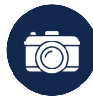
Xavier Photography Society (XPOSURE)