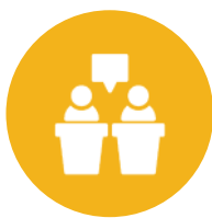
Xavier's University Debating Society (XUDS)