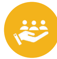
Dr. B. R. Ambedkar Legal Aid Clinic