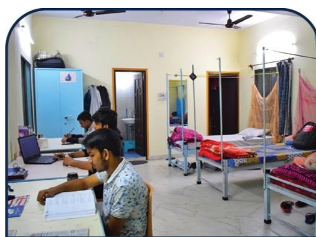
Tripple Sharing Room