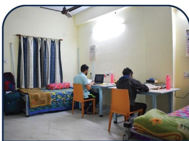
Twin Sharing Room