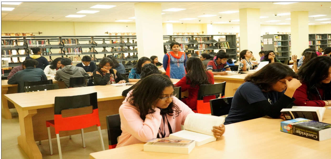
1 st Floor Reading Room of Central Library

The library has the following facilities: