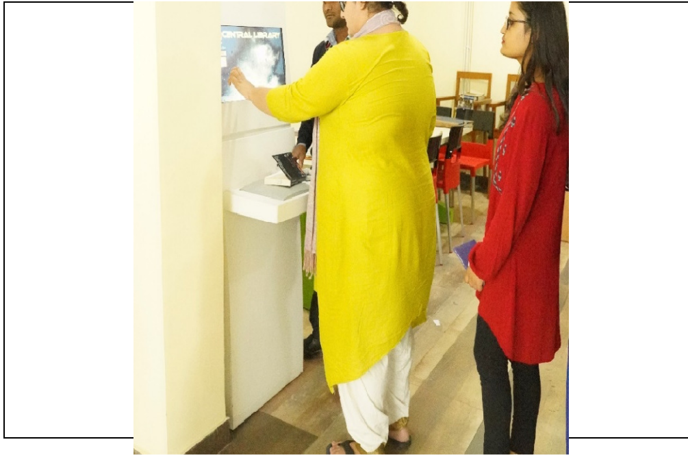
'KIOSK' system facility for the book issue and return